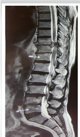
Figure 2: Sagittal MRI view showing D10-D11 spondylodiscitis with epidural granulation tissue causing spinal cord compression and a skip lesion with discitis at L4-L5 region.