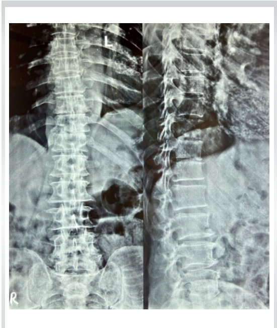
Figure 1: X-ray dorsolumbar spine showing D10-D11 and L4-L5 narrowed disc space and D10-D11 sclerosis of endplates.